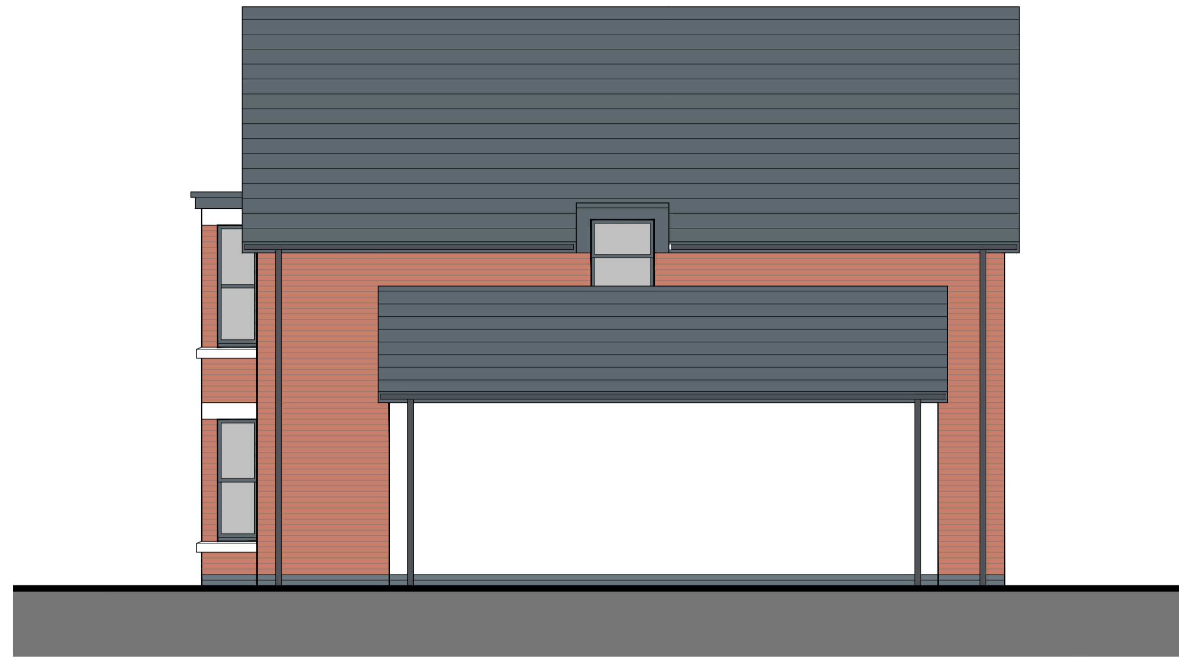
03 SIDE ELEVATION 1:50