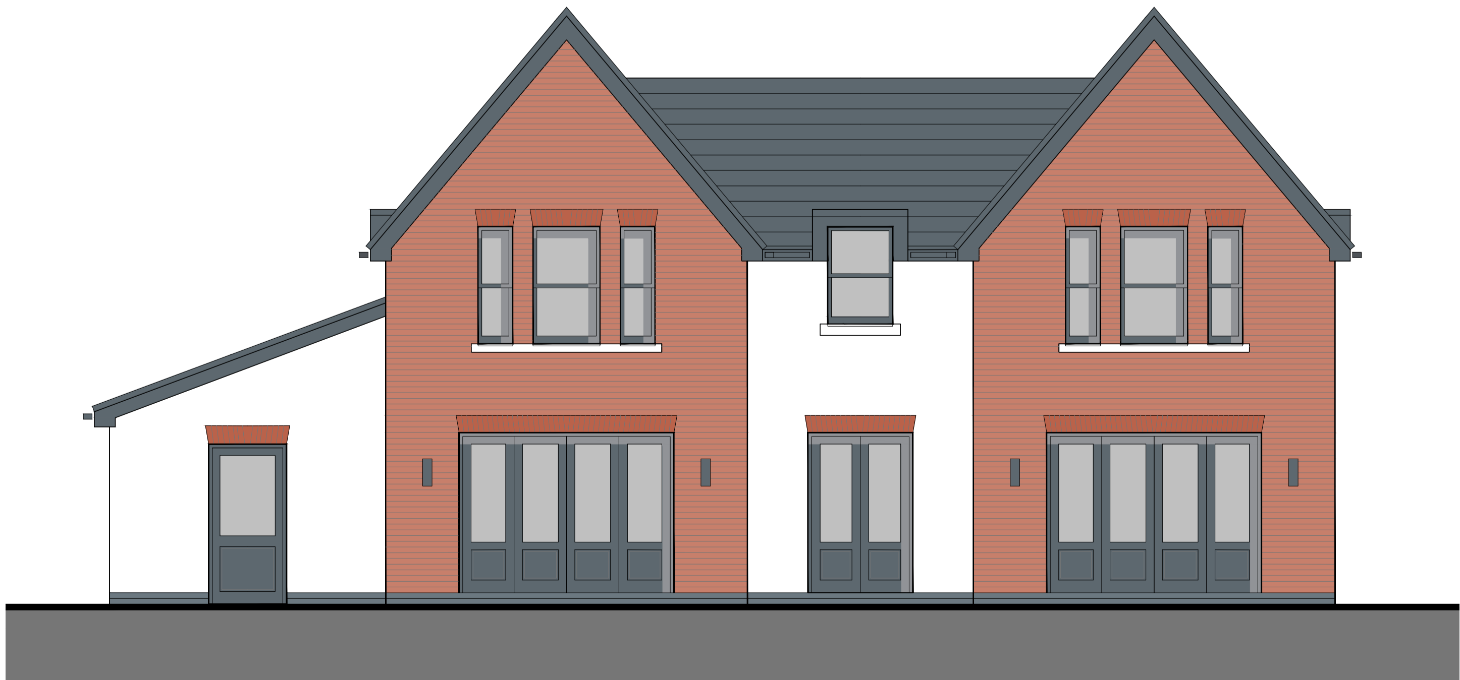
02 REAR ELEVATION 1:50