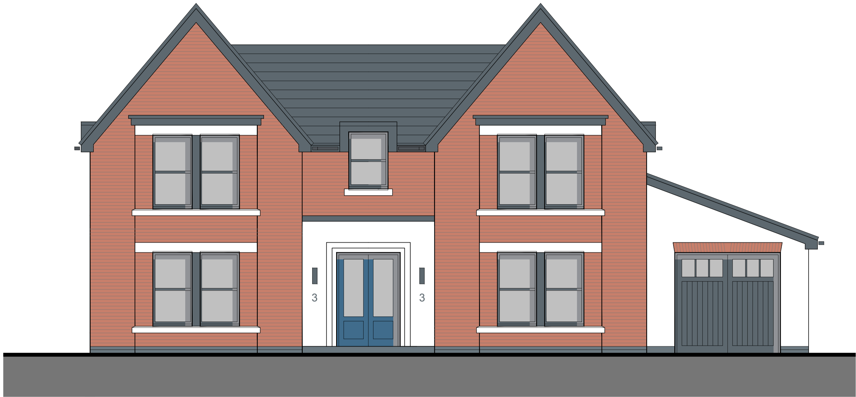
01 FRONT ELEVATION 1:50