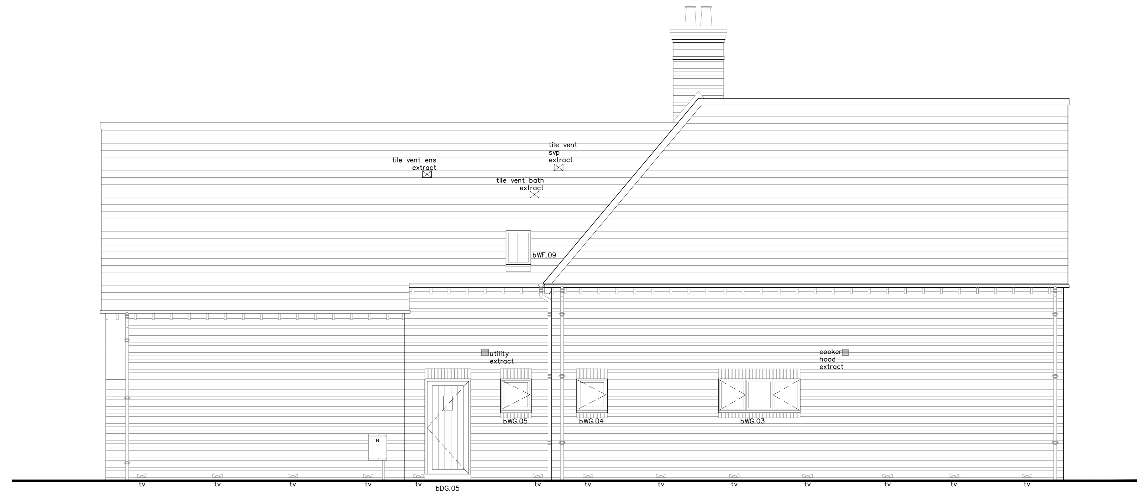
02 SIDE ELEVATION 1:50