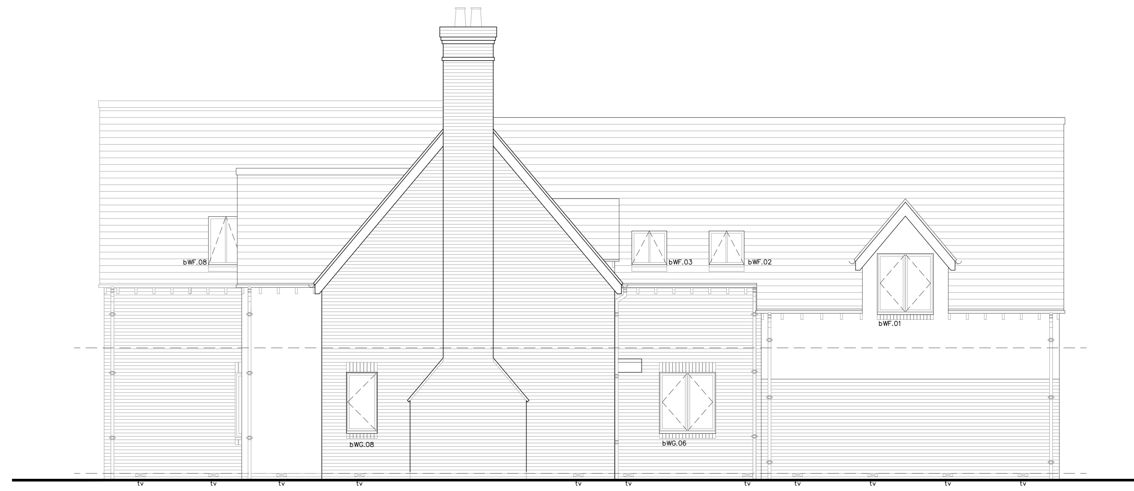
04 SIDE ELEVATION 1:50