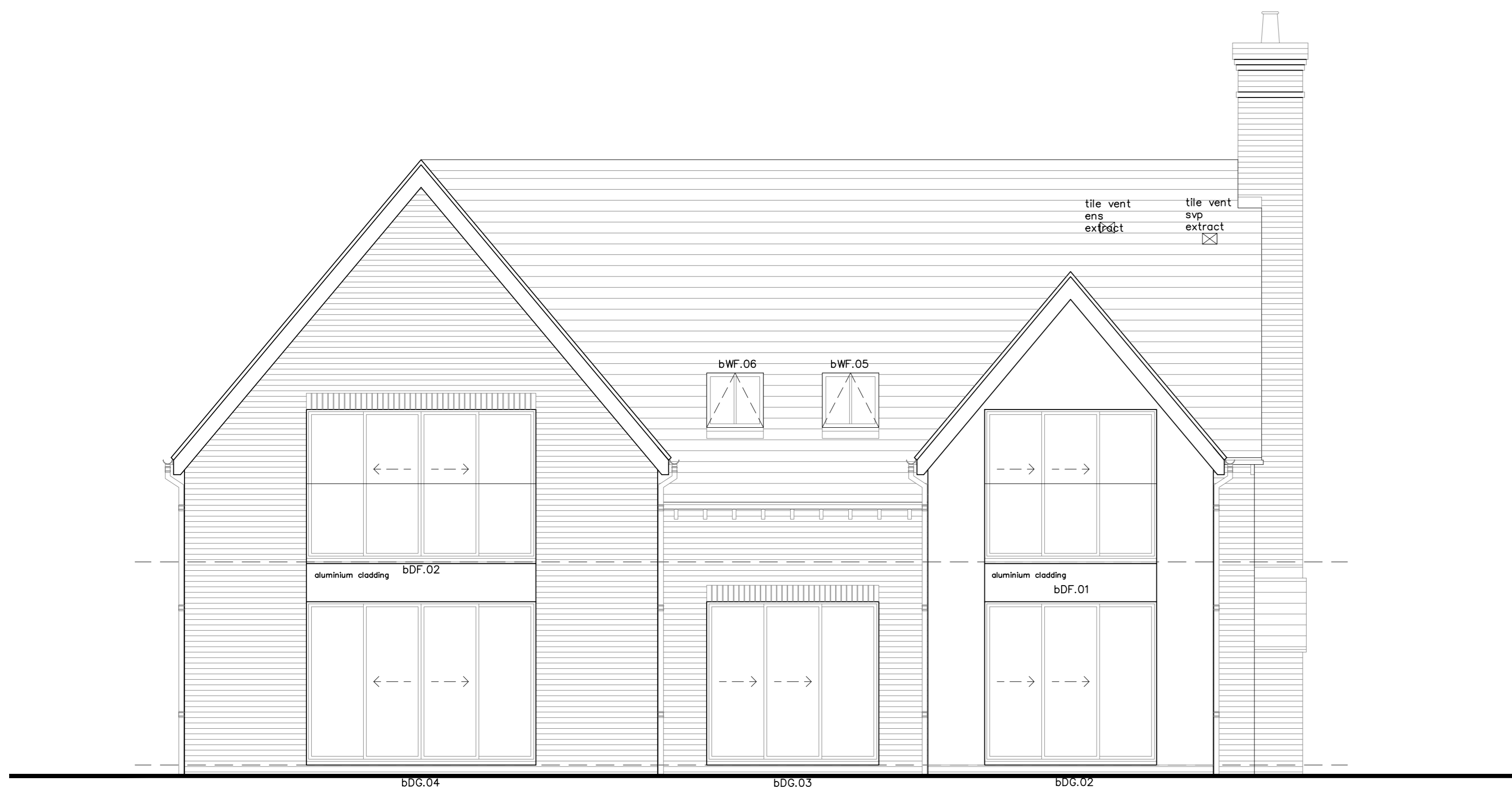
03 REAR ELEVATION 1:50