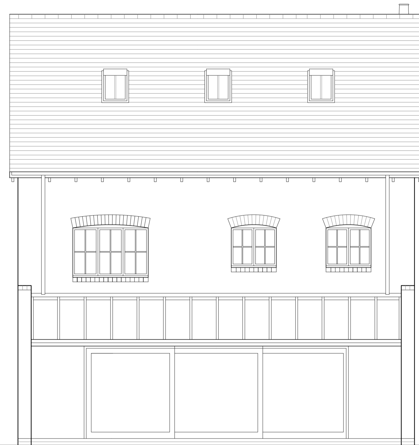
02 REAR ELEVATION 1:50