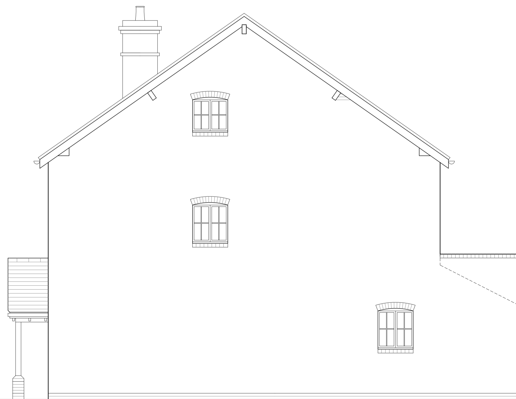
04 SIDE ELEVATION 1:50