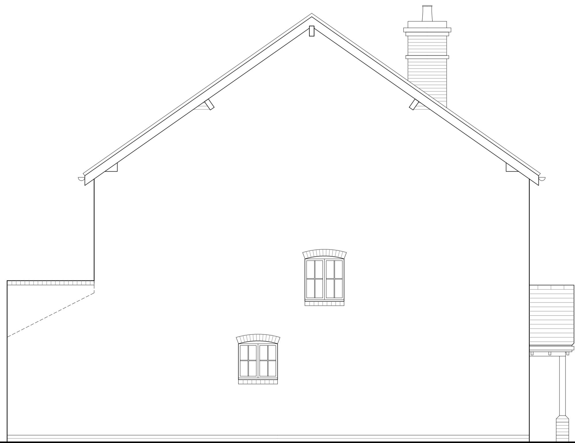
03 SIDE ELEVATION 1:50