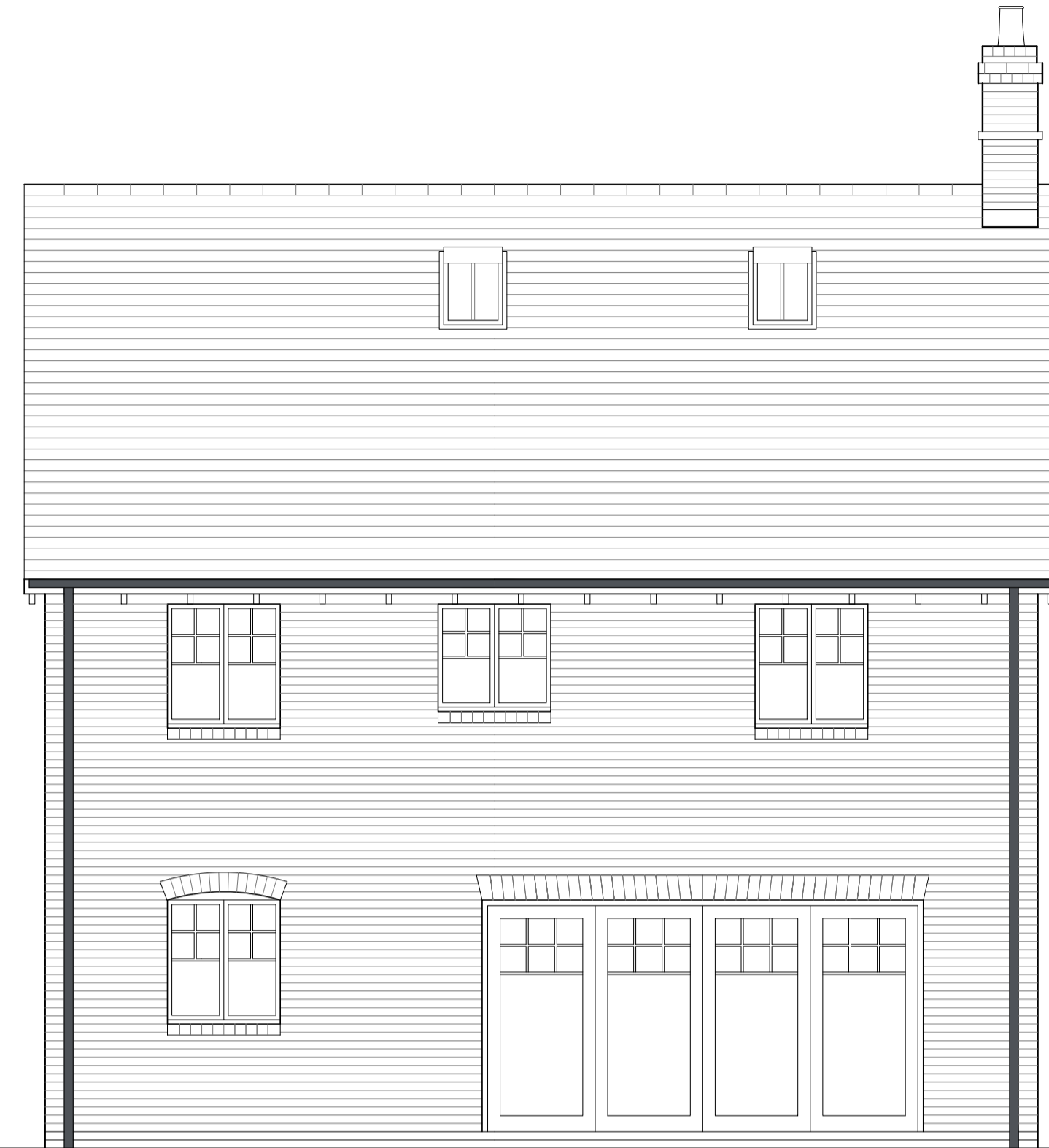
02 REAR ELEVATION 1:50