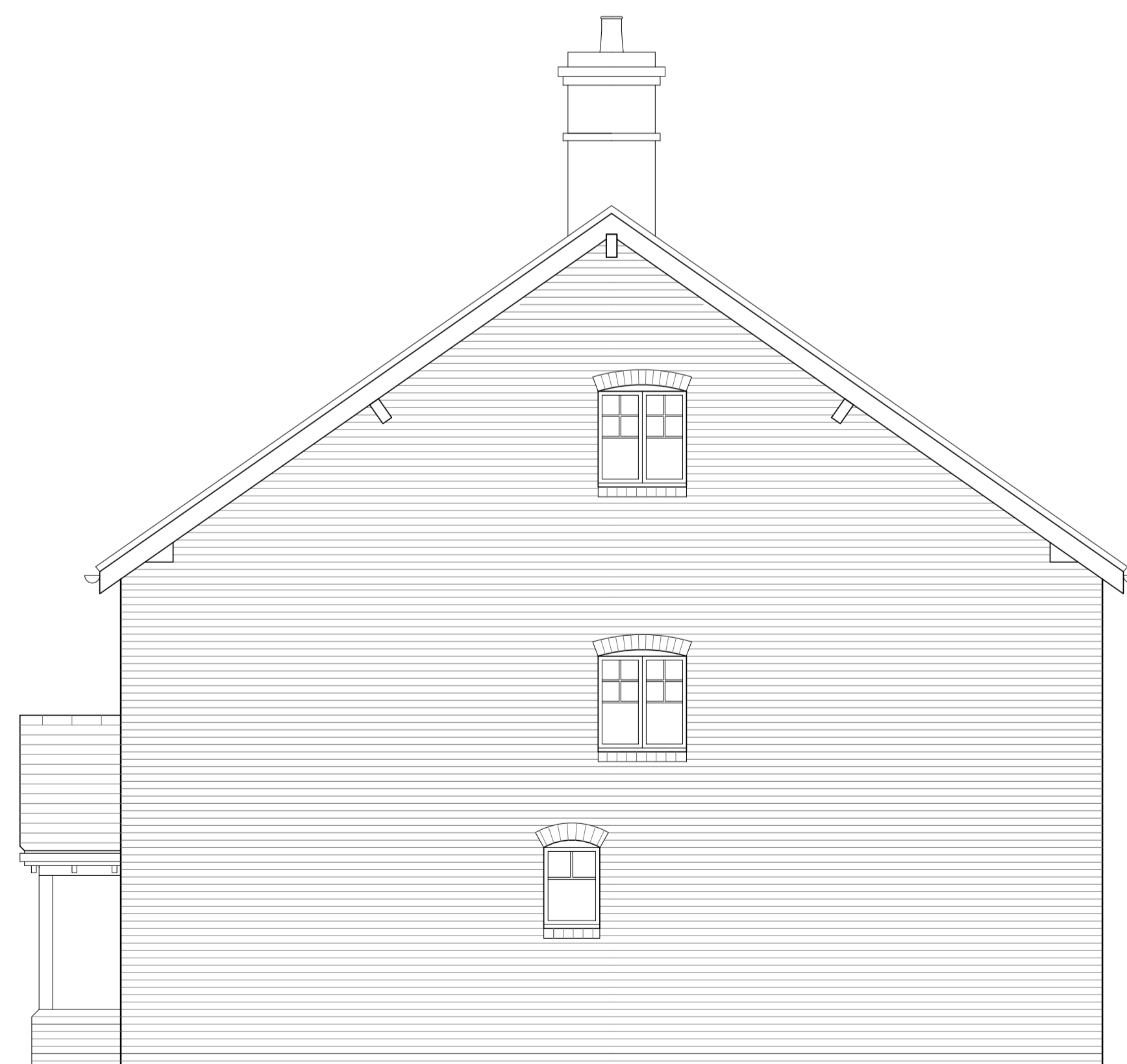
04 SIDE ELEVATION 1:50