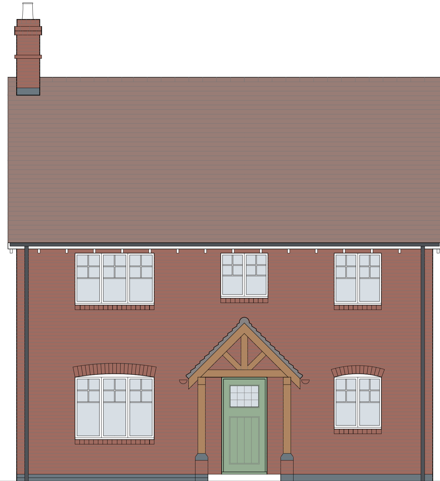
01 FRONT ELEVATION 1:50