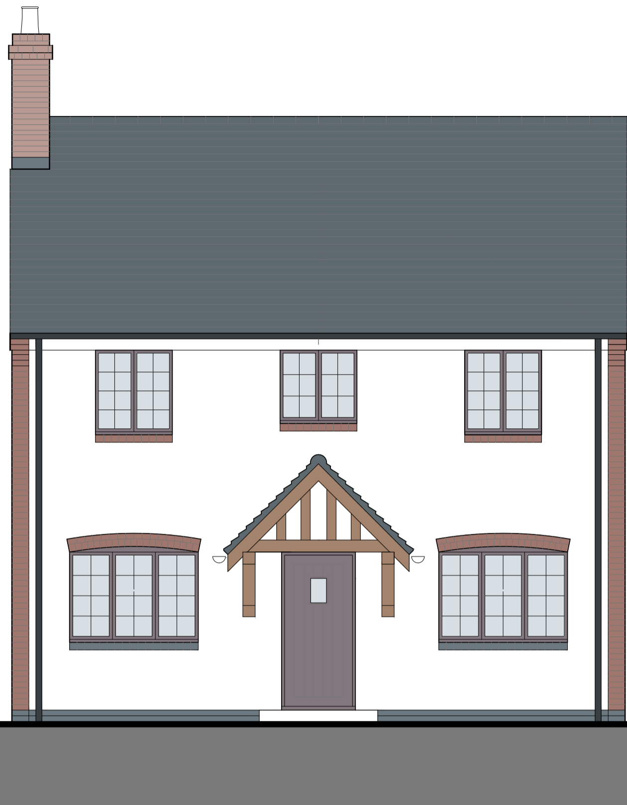
01 FRONT ELEVATION 1:50