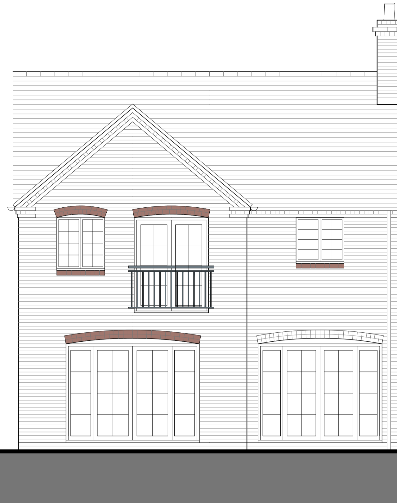
02 REAR ELEVATION 1:50