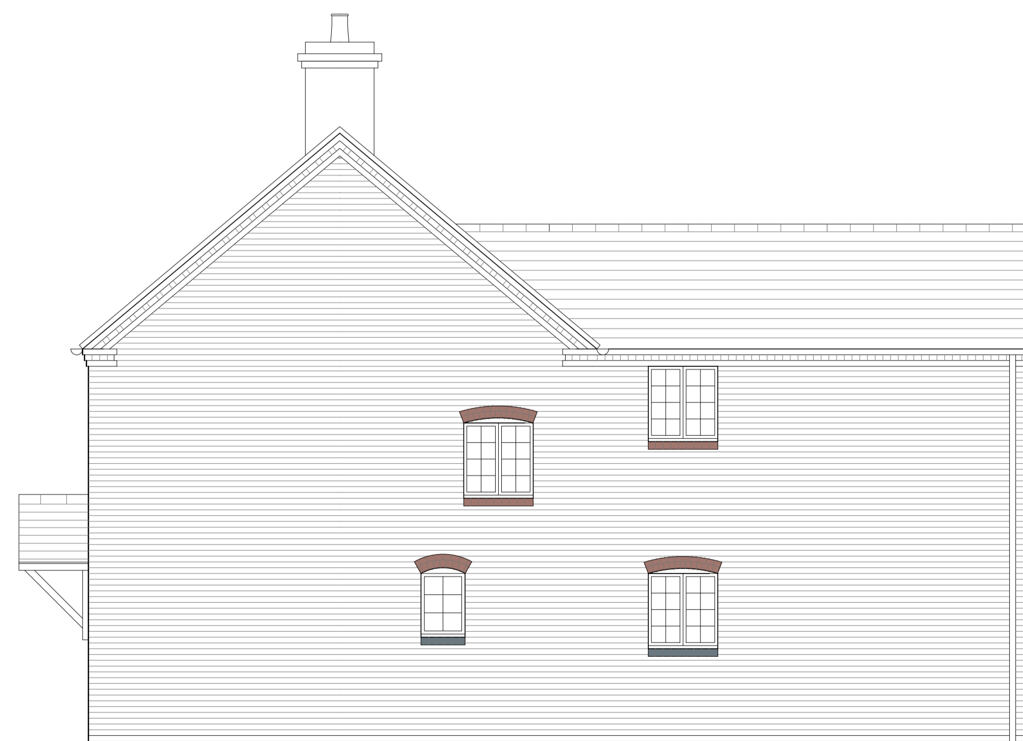
04 SIDE ELEVATION 1:50