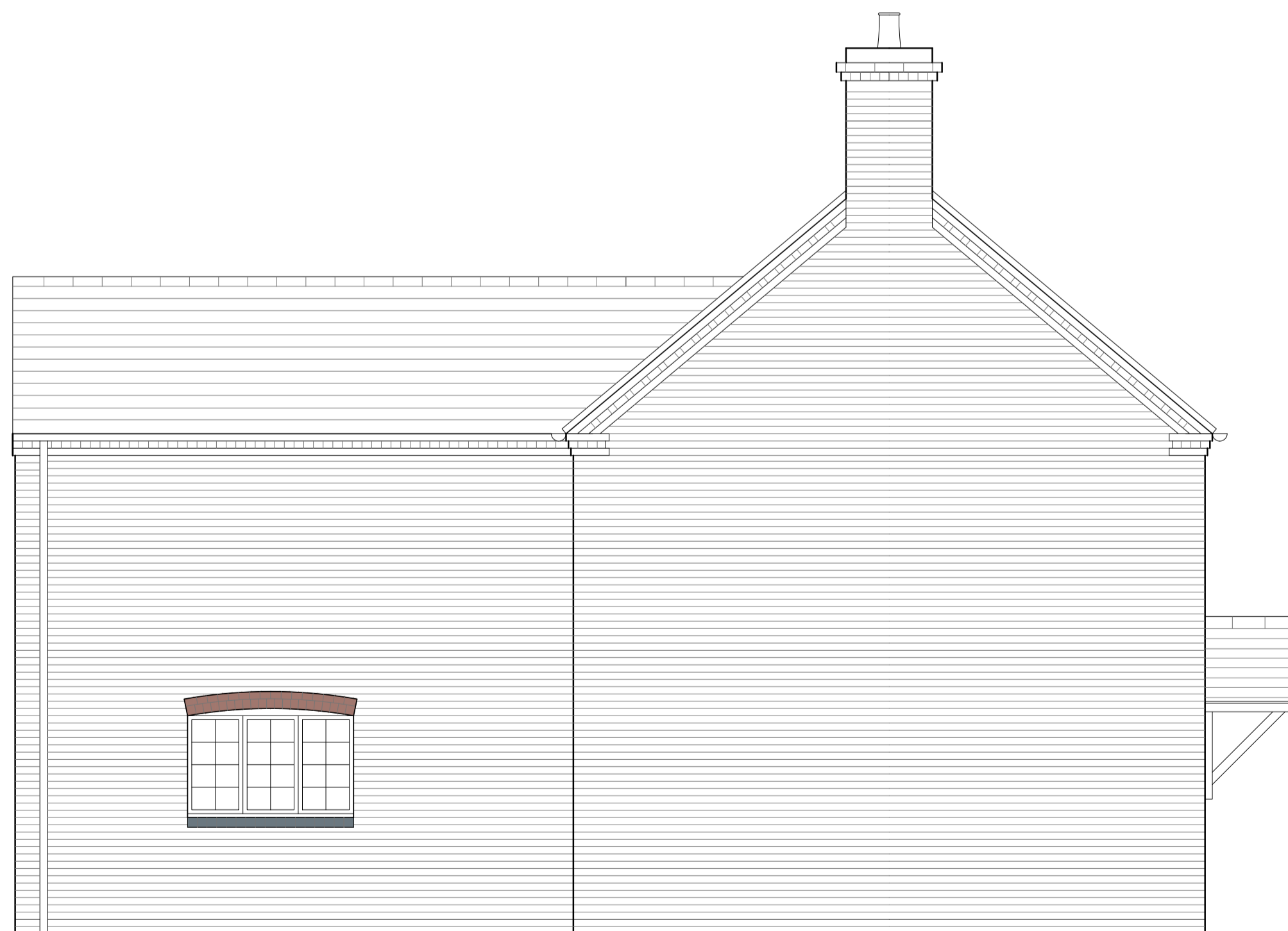
03 SIDE ELEVATION 1:50