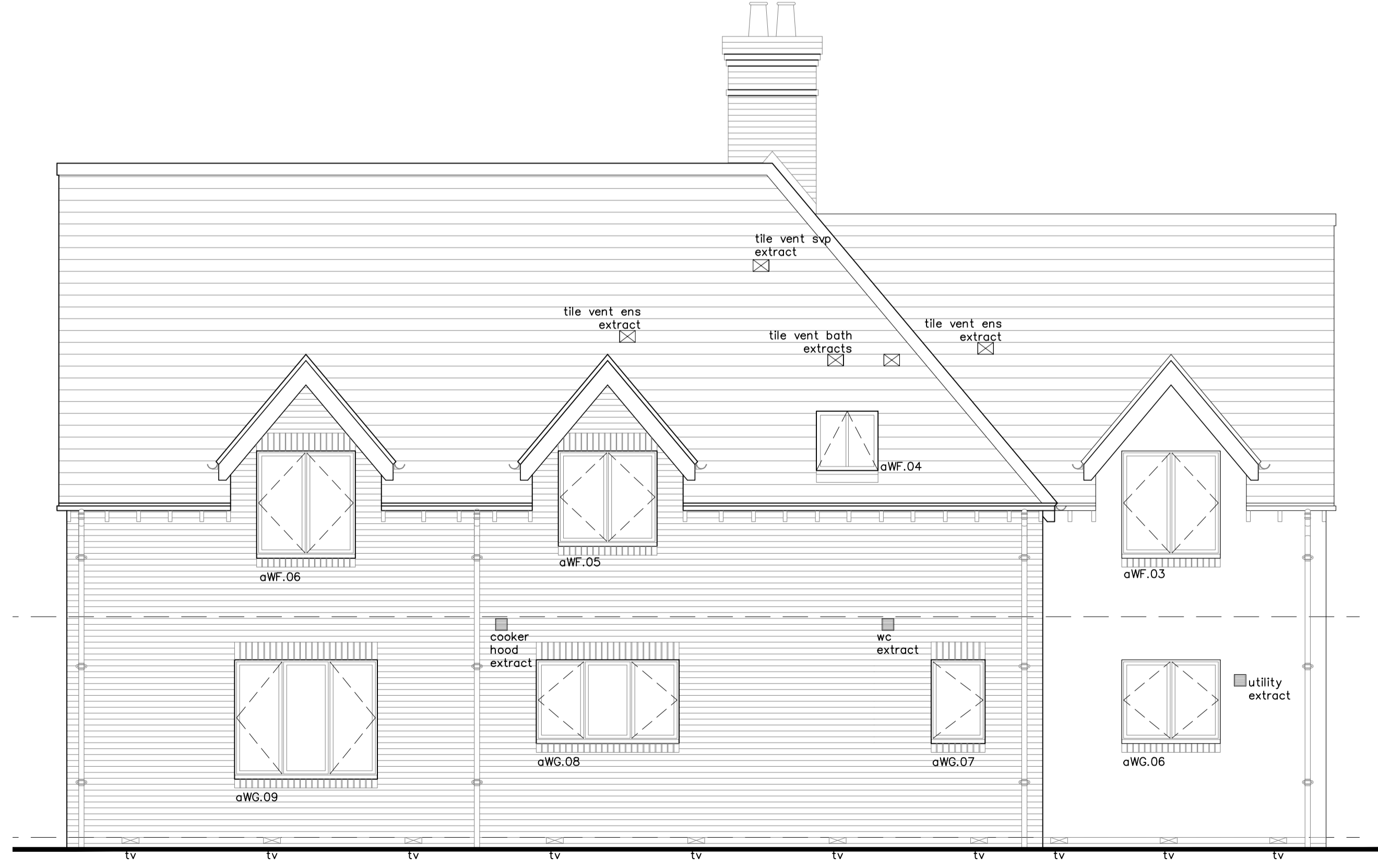
04 SIDE ELEVATION 1:50