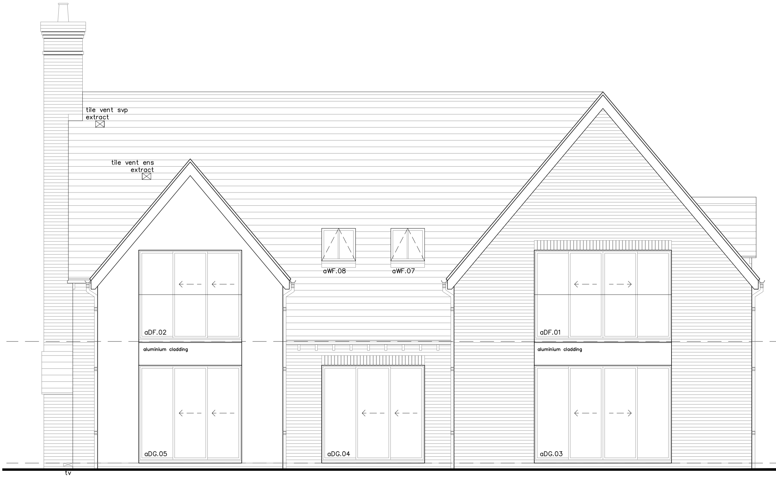
03 REAR ELEVATION 1:50