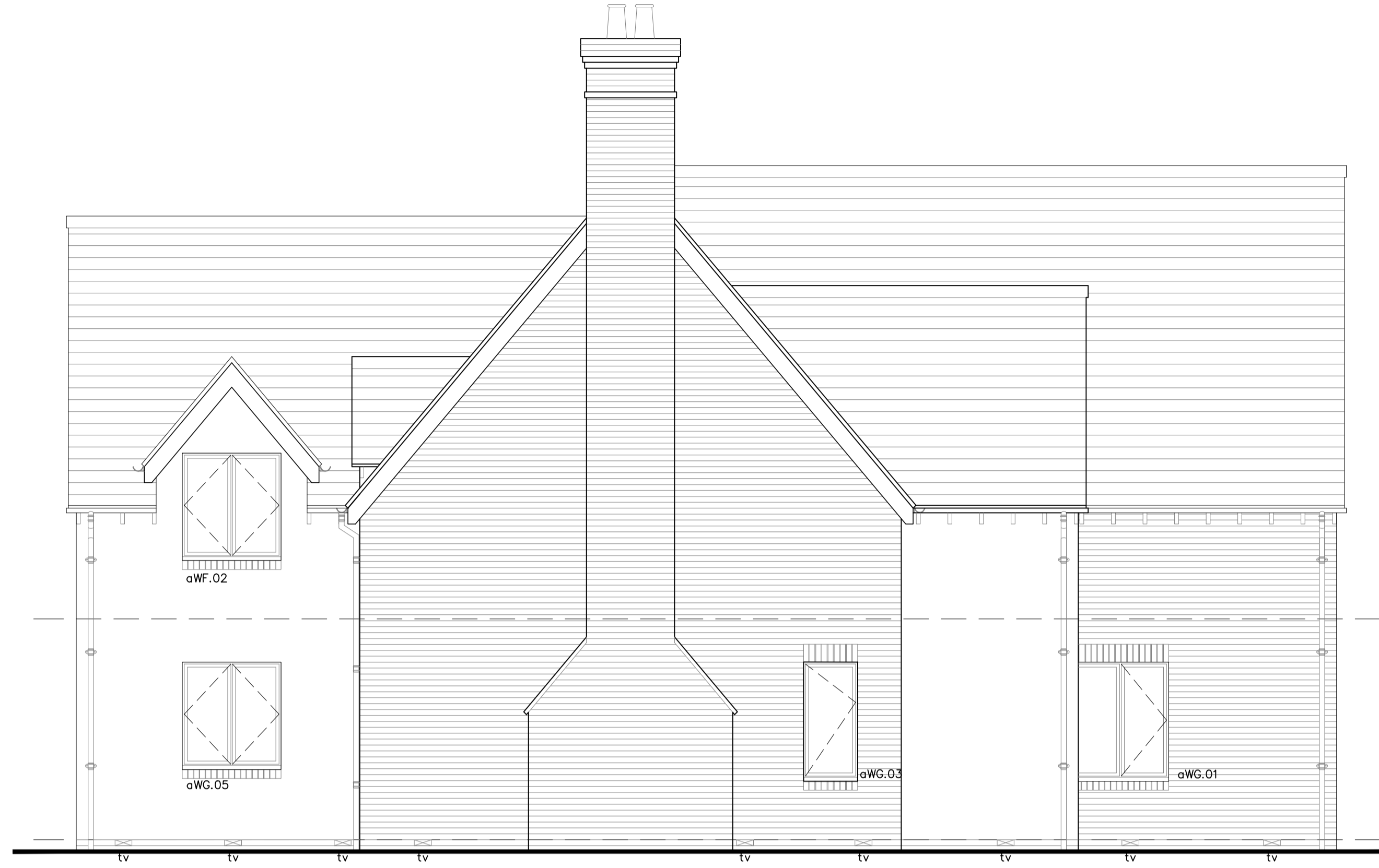
02 SIDE ELEVATION 1:50