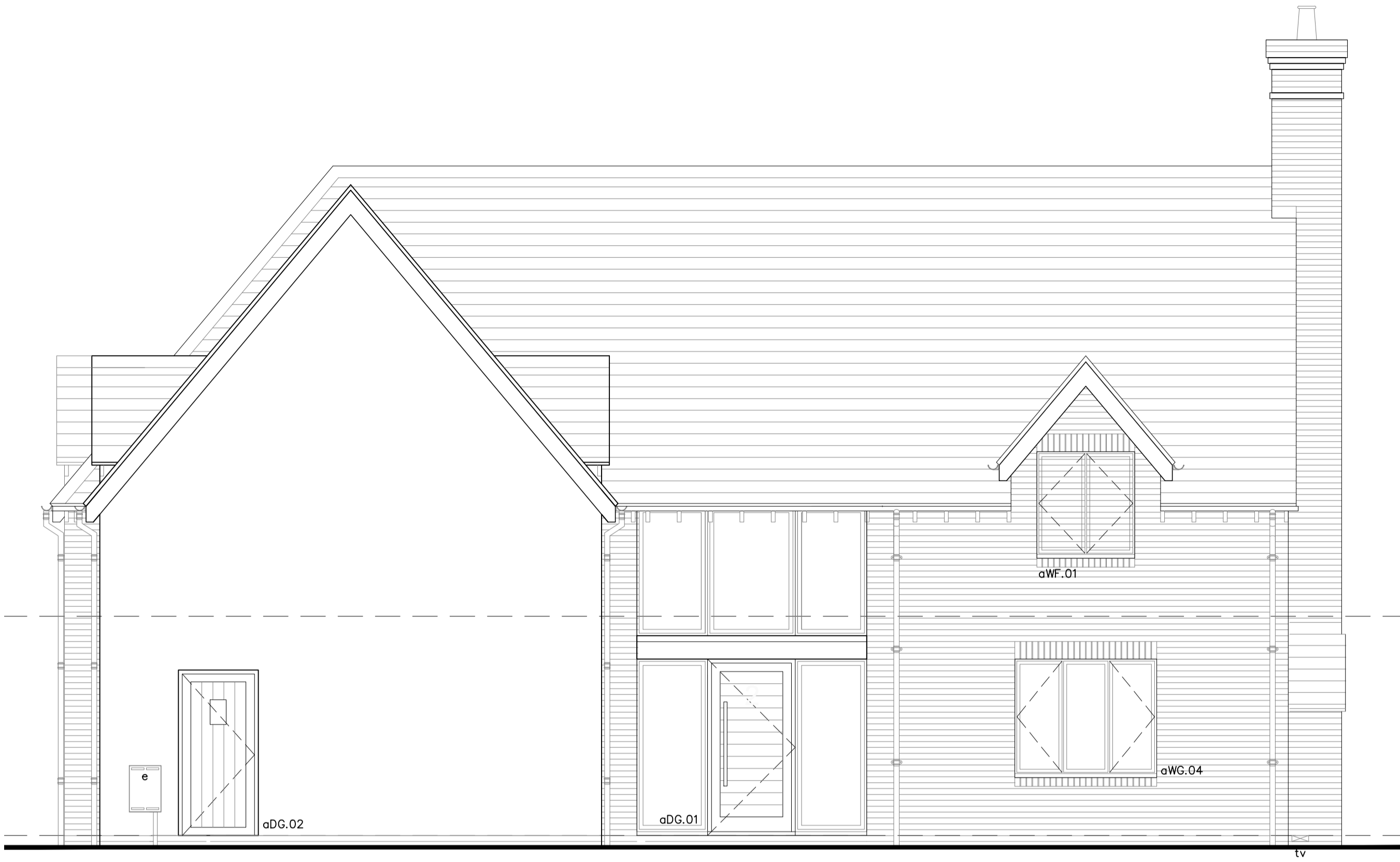
01 FRONT ELEVATION 1:50