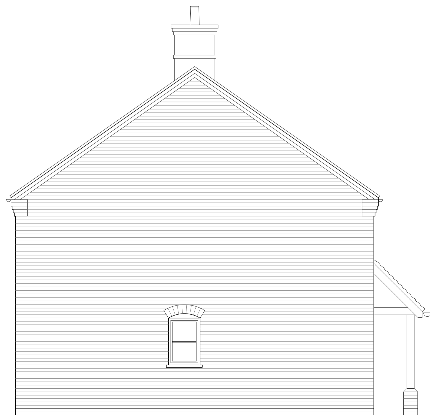
03 SIDE ELEVATION 1:50