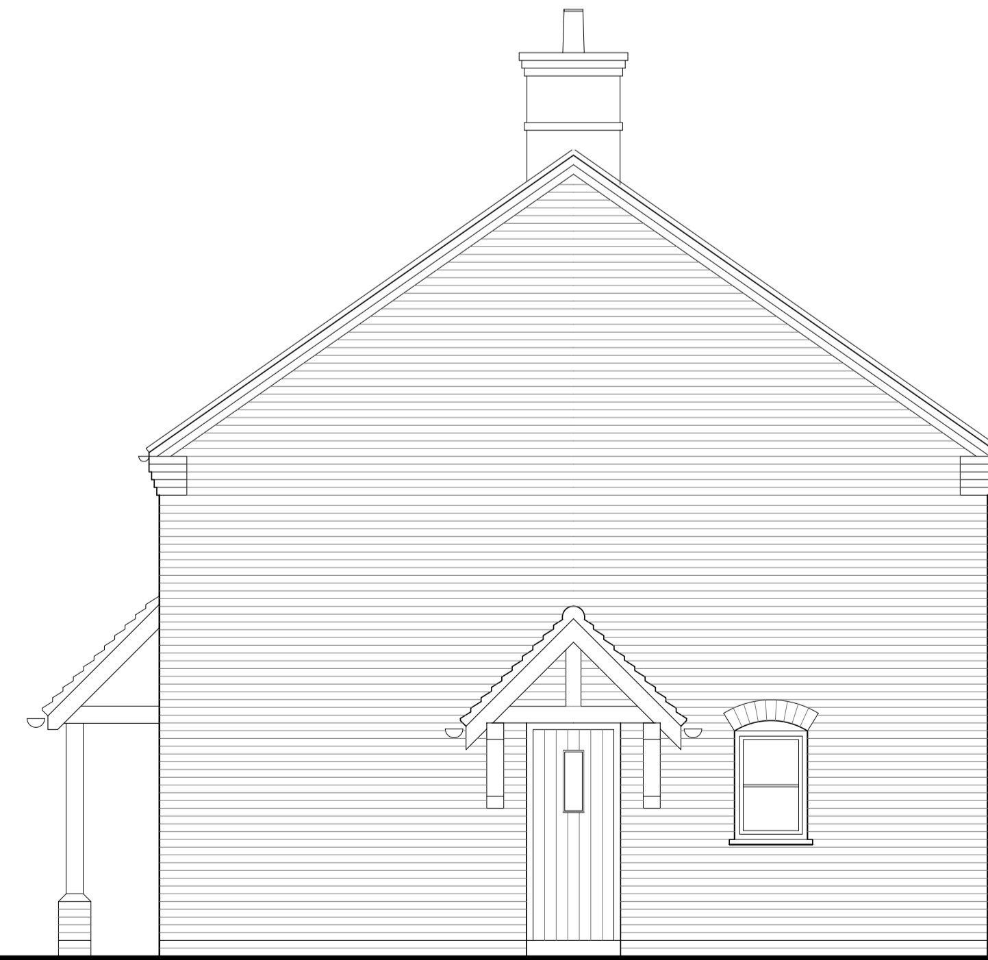
04 SIDE ELEVATION 1:50