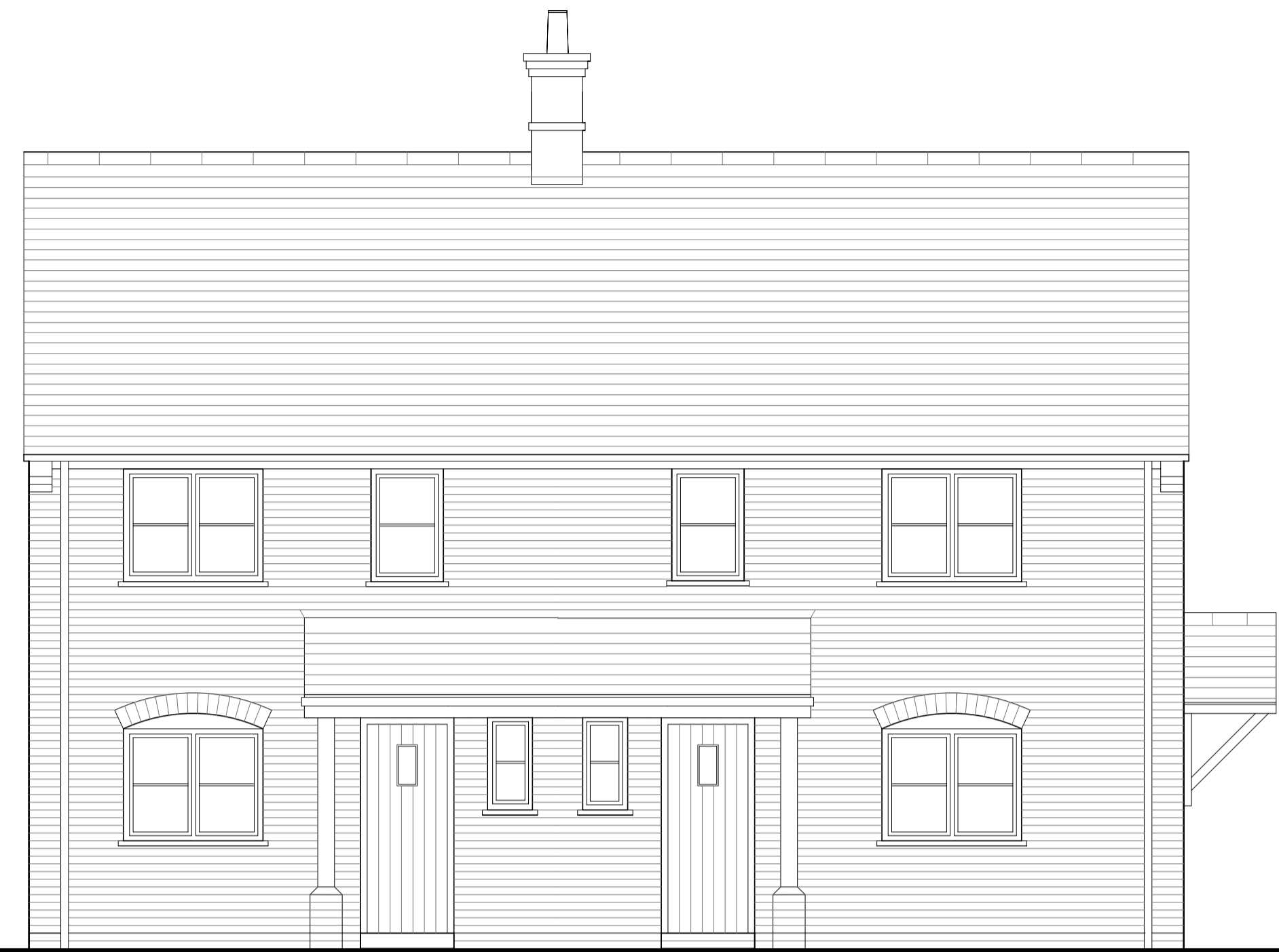
01 FRONT ELEVATION 1:50