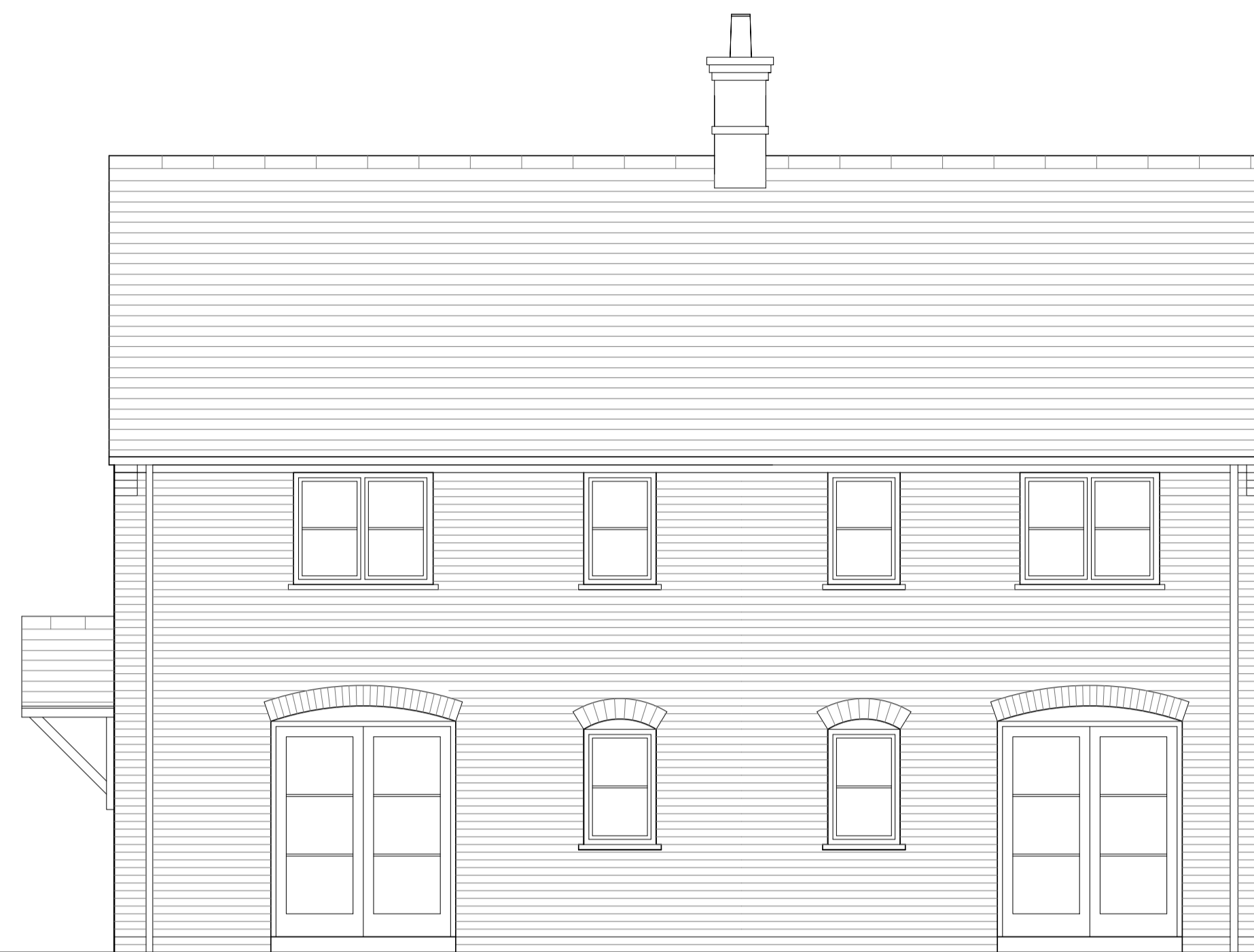
02 REAR ELEVATION 1:50